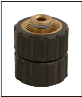
F22 x F22