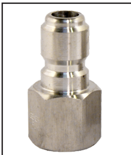
Straight Thru PW Plug 303SS