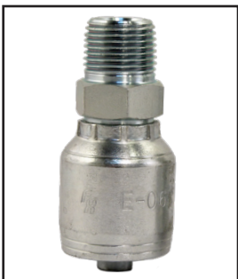
Male Pipe 1-Peice