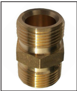
M22 x M22