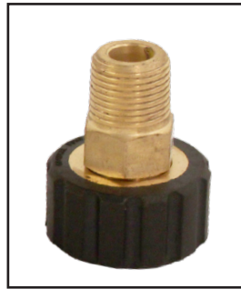
MP X F22