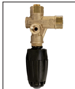
4500 PSI PW Regulator