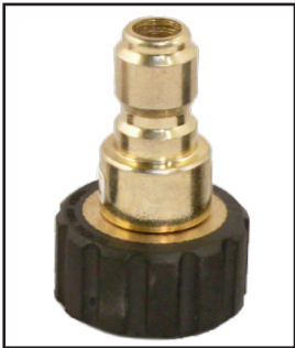
QD Plug XM22