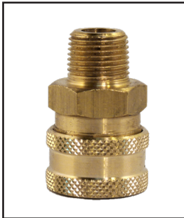
QC Coupler Brass

*Add S3 at the end of Part No. for 303 Stainless Steel.