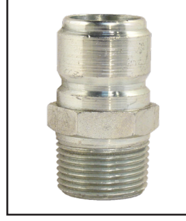
QC Plug Straight Thru 303SS