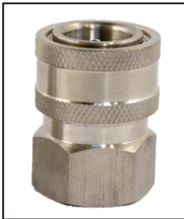
Straight Thru PW Coupler 303SS