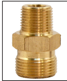
6MP x M22