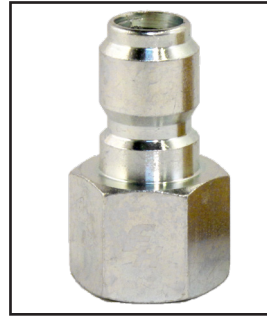
Straight Thru Plug Steel