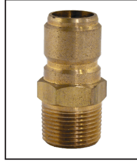
QC Plug Straight Thru Brass