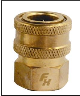
Straight Thru Coupler Brass