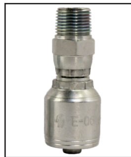
Male Pipe 1-Piece Swivel