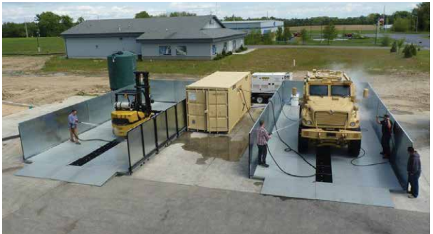
Typical application of Water Blaster with dual wash bays

The Water Blaster is ideal for pre-wash operations where it automatically draws water from a collection pit, filters it through an inline strainer and sends it back to the Water Blaster for reuse in knocking off caked-on mud.